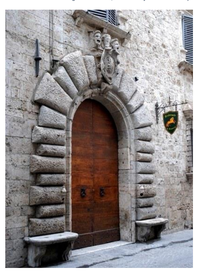
4 - The Building is characterized by a facade enriched by two portals worked to ashlar and decorated by three orders of windows. In 1582, the Palace has been extended of 12 meters to the purpose to equip the residence with a great saloon tall two floors. The two portals lead to the garden.