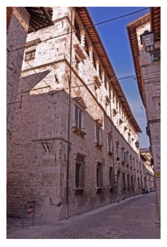
- The Palace is one of the most severe and sumptuous patrician buildings of the second halves of the XVI century in the city of Ascoli Piceno.