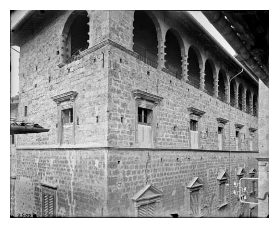
5 - Characteristic it is the terminal open gallery along the whole front, composed by 18 arcades imitating trunks of tree. This allegory represents the trees of Mulberry, from which the silkworms were produced.