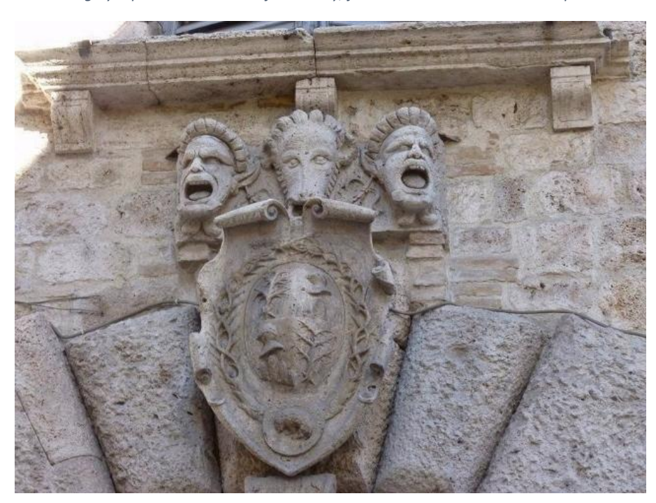
6 - The two larges masks posts to the side of the portal with to the center the noble coat of arms, they perhaps concealed in the faucis shot mouths, while the two masks posts in low were used for communicating from the road with the inside.